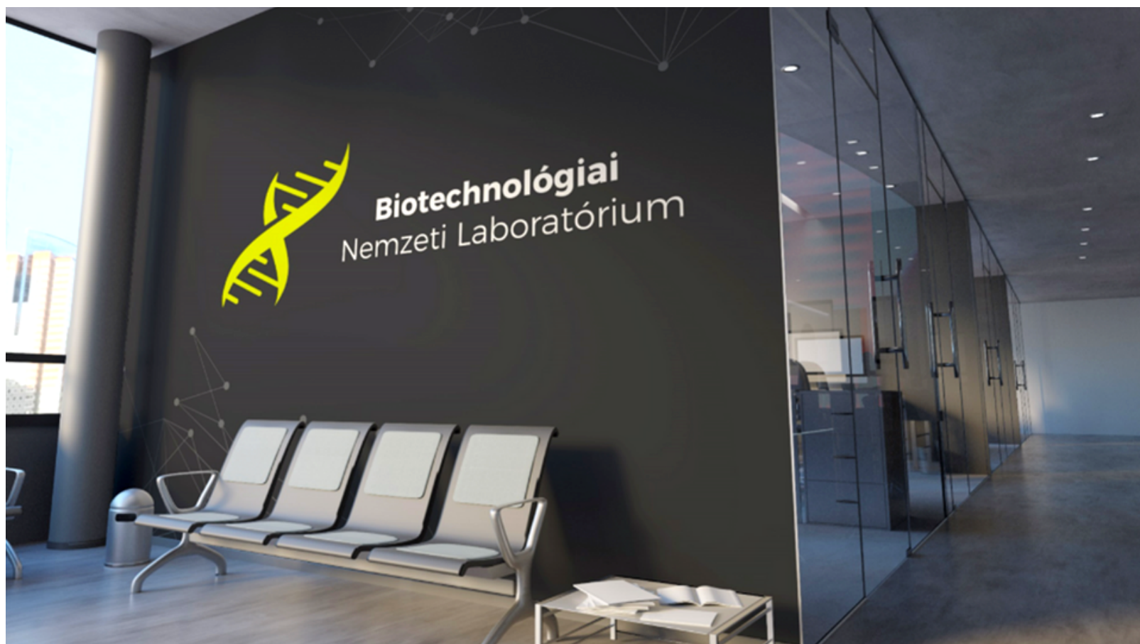
Design plan of the BSL-3 laboratory of the BNL – under construction

Companies for drug development, production and trade, companies organizing clinical trials of putative medicines, medical doctors.