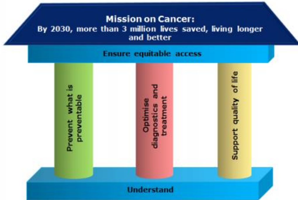
Figure 1. Intervention areas for action